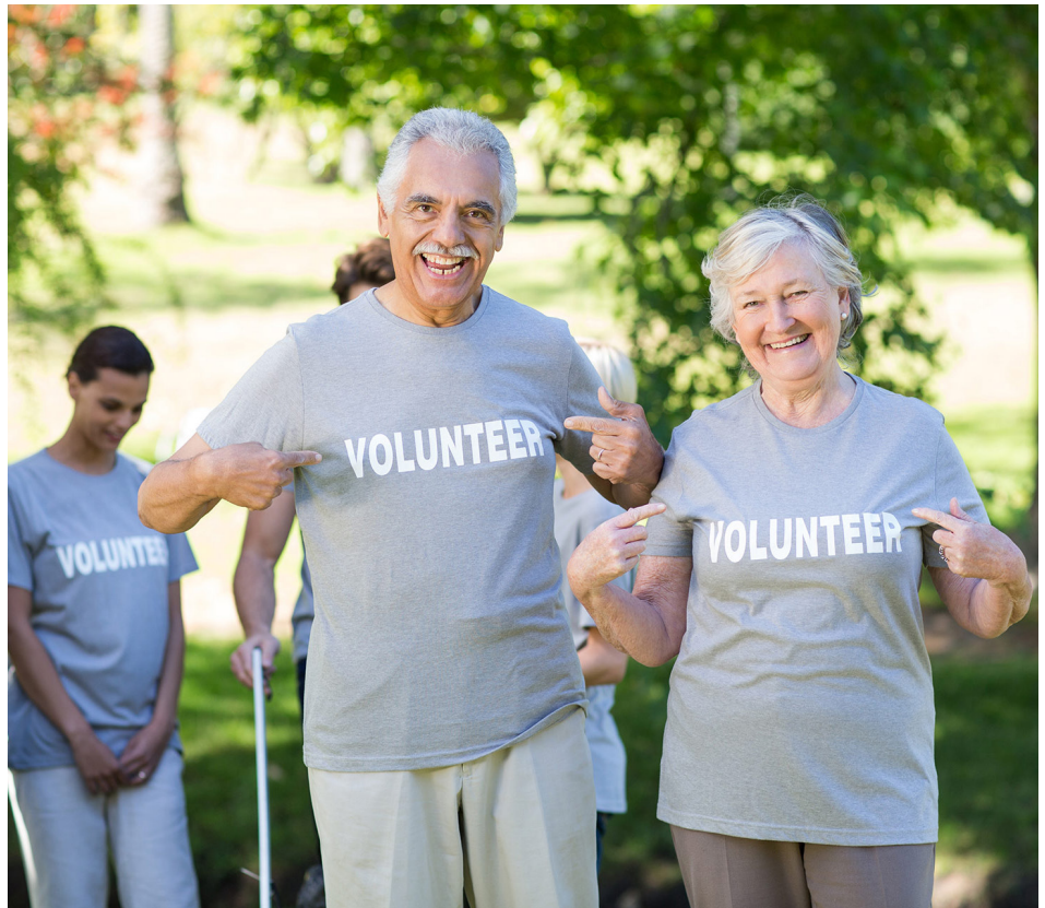
Good for You: Volunteer!"

To help educate older adults about the benefits of volunteering, the National Association of Area Agencies on Aging (n4a) launched a public education campaign to raise awareness of the issue and to prompt older adults to take action. The centerpiece of the campaign is a publication, "Doing Good Is