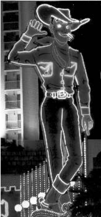
From "The Magic Sign" ST Publications Cincinnati, OH

Young Electric Sign, license #780 Since 1945