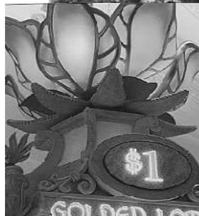
From YESCO Interiors, Golden Lotus, Mandalay Bay Resort & Casino, Las Vegas, Nevada